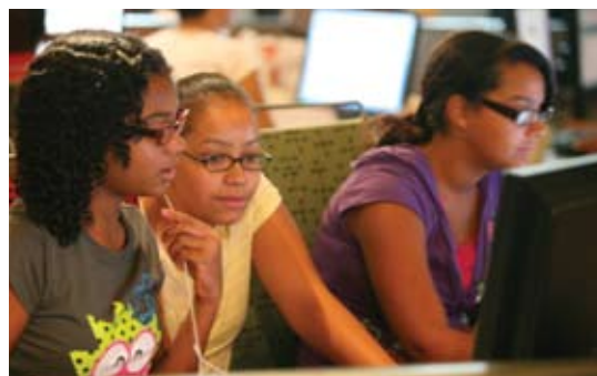
Students in the ATTAIN Computer Lab.