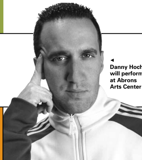
◀ Danny Hoch will perform at Abrons Arts Center