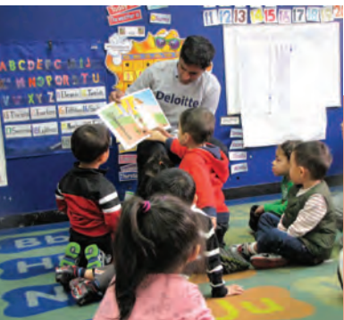
Volunteers, like these individuals from Deloitte Consulting, left, and Citi Global Banking, below, enhance Henry Street programs.