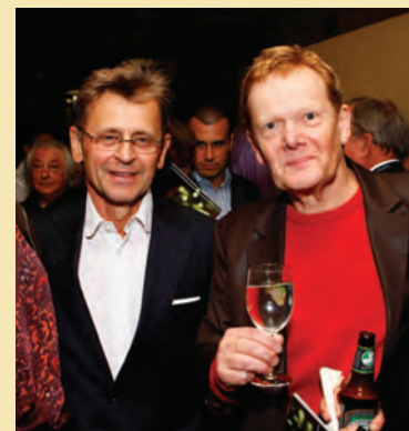
Mikhail Baryshnikov, honorary chairman of Uptown | Downtown, with Philippe Petit, who performed.