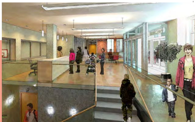
Rendering of the interior of 301 Henry Street.