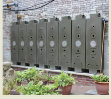
The eight containers on the wall behind the garden can hold 400 gallons of water.

The Rain Garden project was completed with help from GrowNYC and WE | Design.